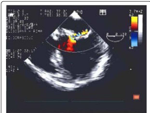
Figure 2 Transesophageal echocardiographic view of mitral valve: moderate-severe mitral regurgitation with jet originating centrally and directed towards lateral wall of the left atrium is seen.

Echocardiography is the first choice technique in the evaluation of suspected or known mitral valve congenital abnormalities, providing useful information about valve anatomical and morphological details, mechanism of MR and its quantitative evaluation.